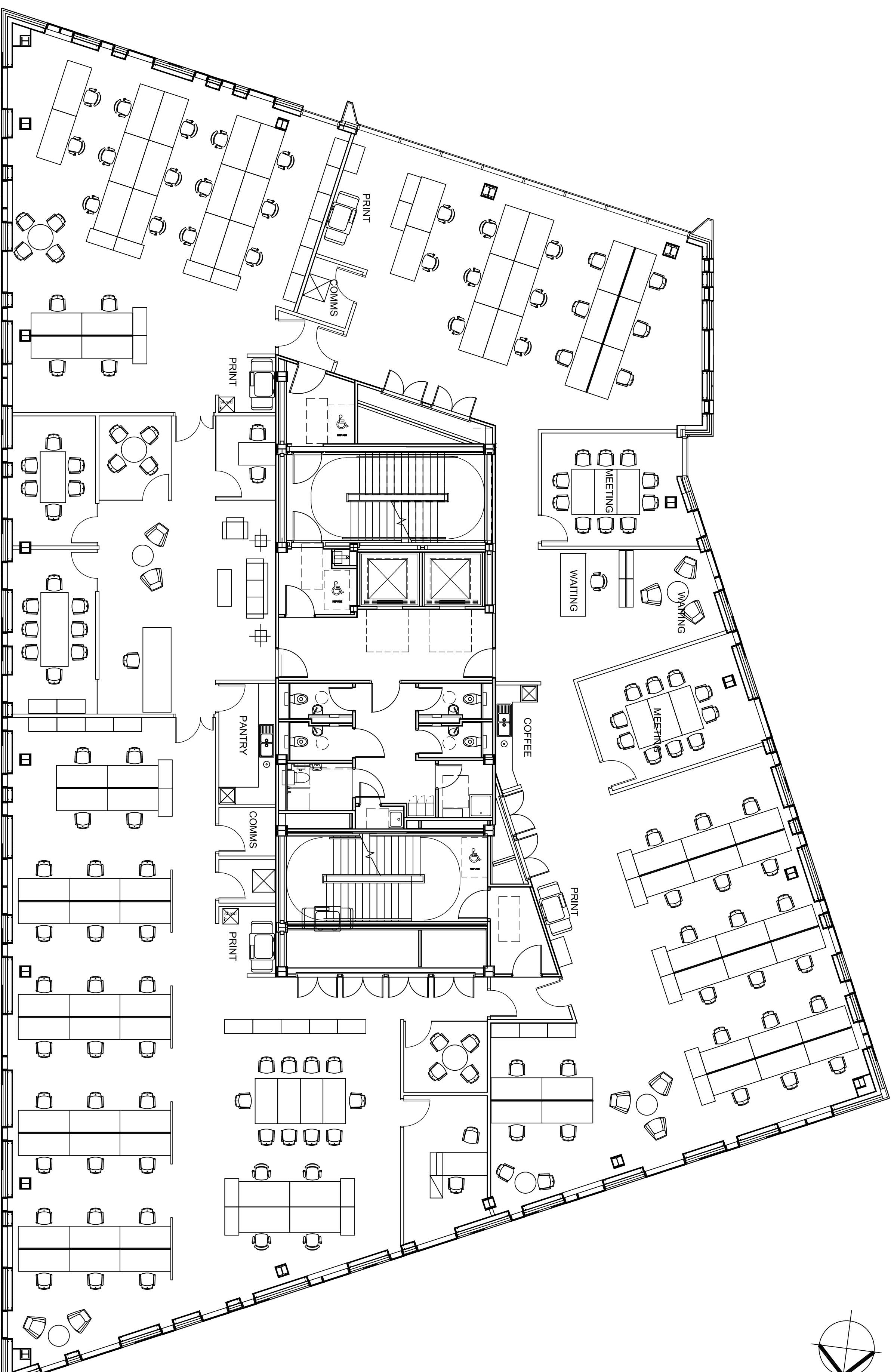
PROPOSED SPACE PLAN - OPTION 2 SCALE 1:100

Suite 1 - WEST SIDE - 499sqm N/A - 51 desks @1.10sqm Suite EAST SIDE - - 350sqm N/A - 34 desks @1.12 sqm